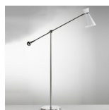
task floor lamp